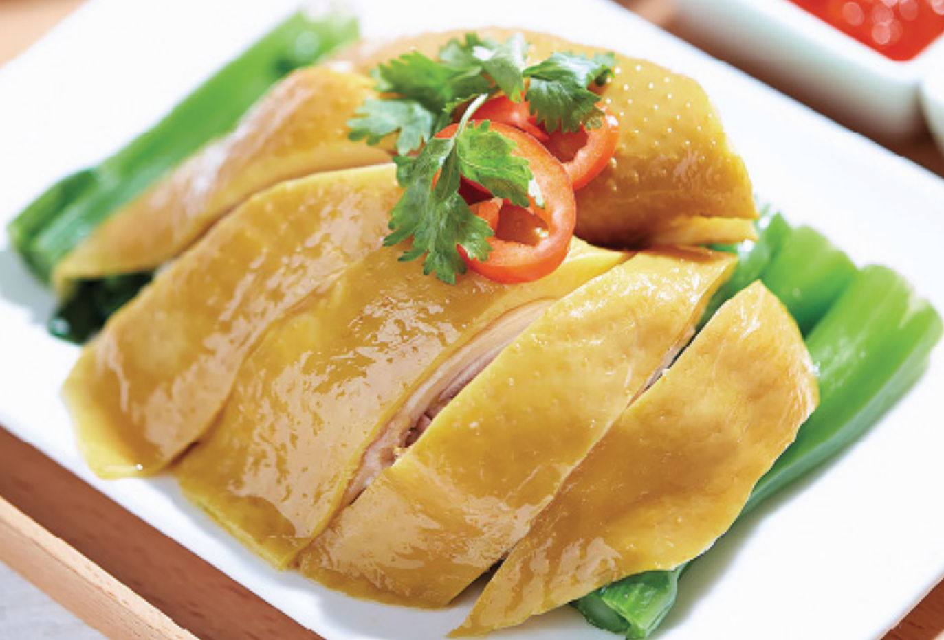
無骨海南雞飯 Hainanese Chicken Rice