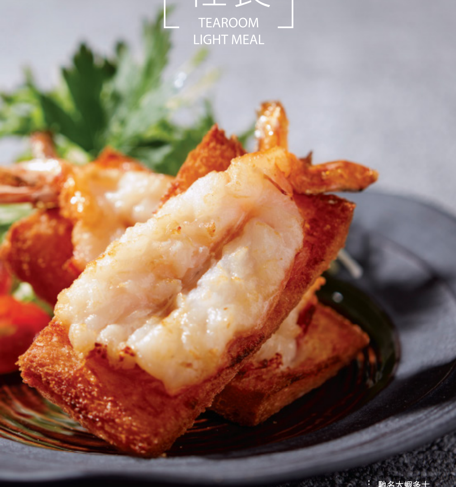
馳名大蝦多士 Prawn Toast