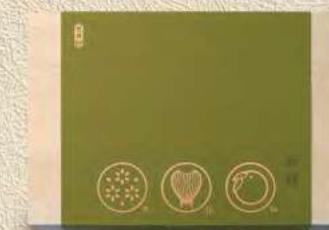
Assorted Mochi Custard 6 pieces (Yuzu, Black Sesame, Matcha Red Bean 2 pieces each) $248