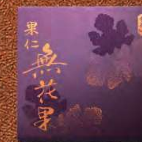
Mini Assorted Nuts with Dried Figs 4 pieces $155