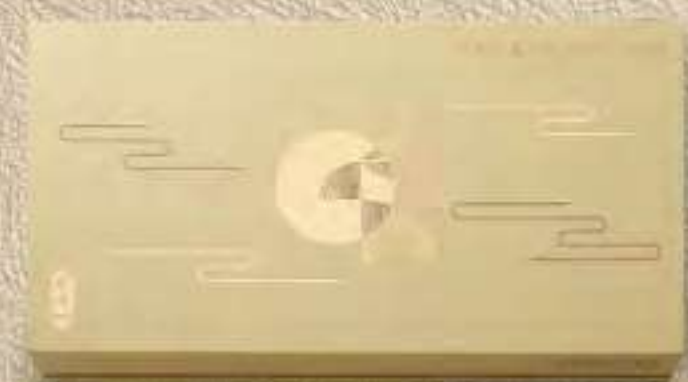
Maltitol Low Sugar Mini Egg Custard 8 pieces $285