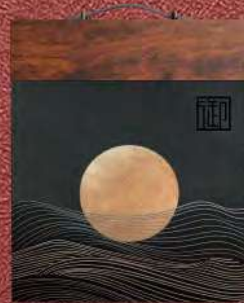
Royal Gift Box $1,538

Kee Wah Celestial Series Mooncake comes in a sumptuous selection of sweet and savoury flavours. Inspired by the heavens, gift boxes are packaged in an ethereal cloud or moon design.