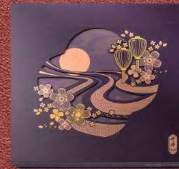
Full Reunion Gift Box 10 pieces $798