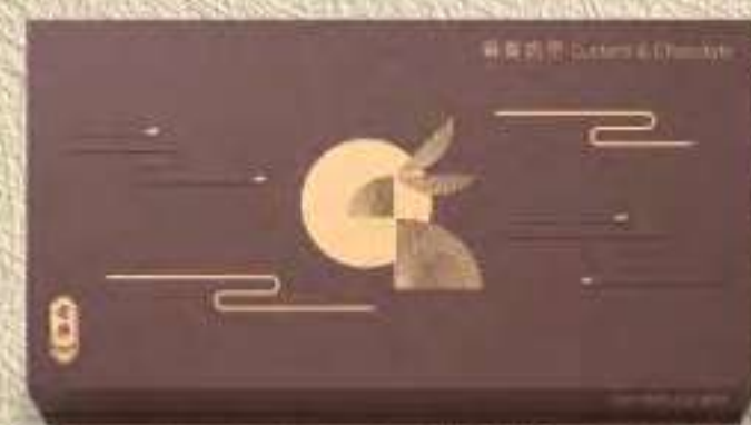
Assorted 8 pieces (Chocolate & Egg Custard, 4 pieces each) $275