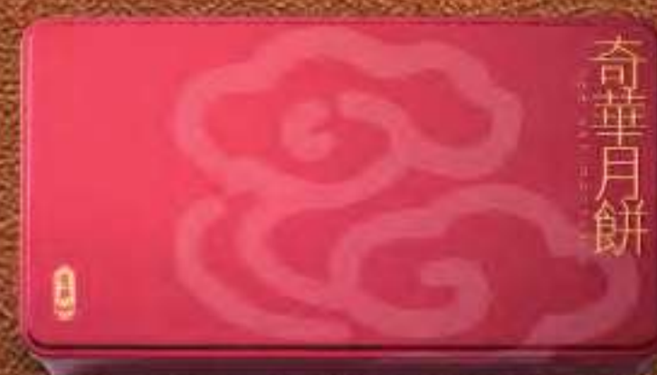
Assorted Gift Box 8 pieces $255