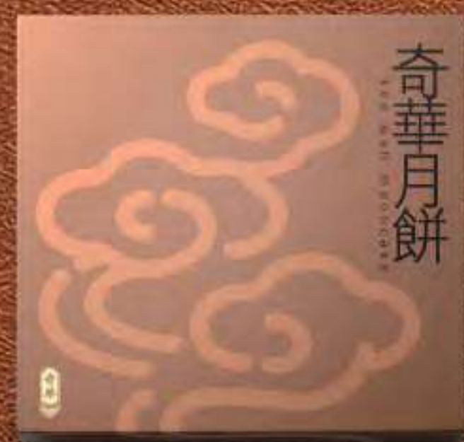
Eight-Star Treasure Box 9 pieces $348