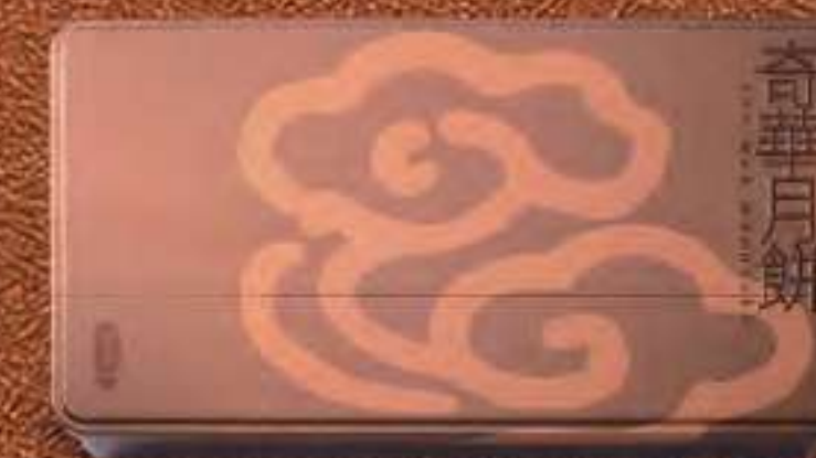
Selected Gift Box 8 pieces $245