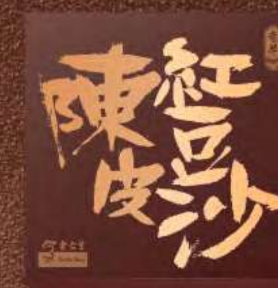
Mini Eu Yan Sang Red Bean Paste with Mandarin Peel 8 pieces

Carefully selected mandarin peel is paired with velvety smooth red bean paste to offer an irresistible taste experience that is delicately sweet and invigorating.