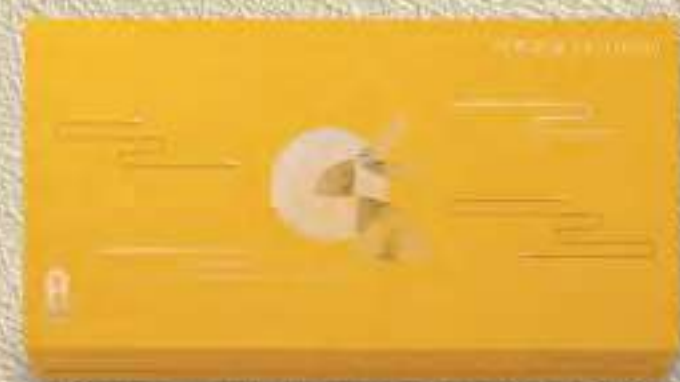
Egg Custard 8 pieces $275