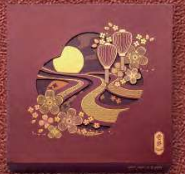
Quadrangle Gift Box 4 pieces $418