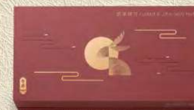
Assorted 8 pieces (Egg Custard & Mini White Lotus Seed Paste with Yolk, 4 pieces each) $275