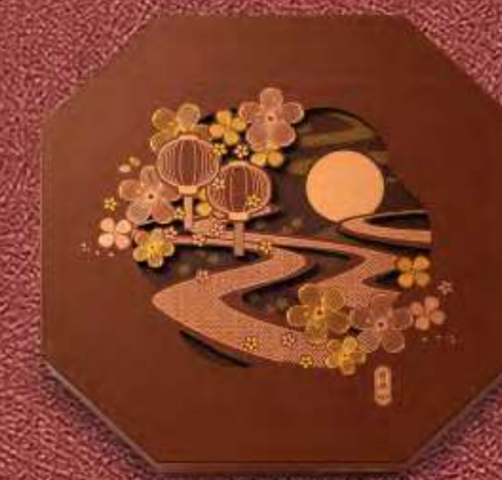
Premium Eight - Star Treasure Box 9 pieces $518