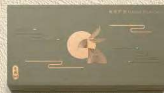
Assorted 8 pieces (Earl Grey Tea & Egg Custard, 4 pieces each) $275