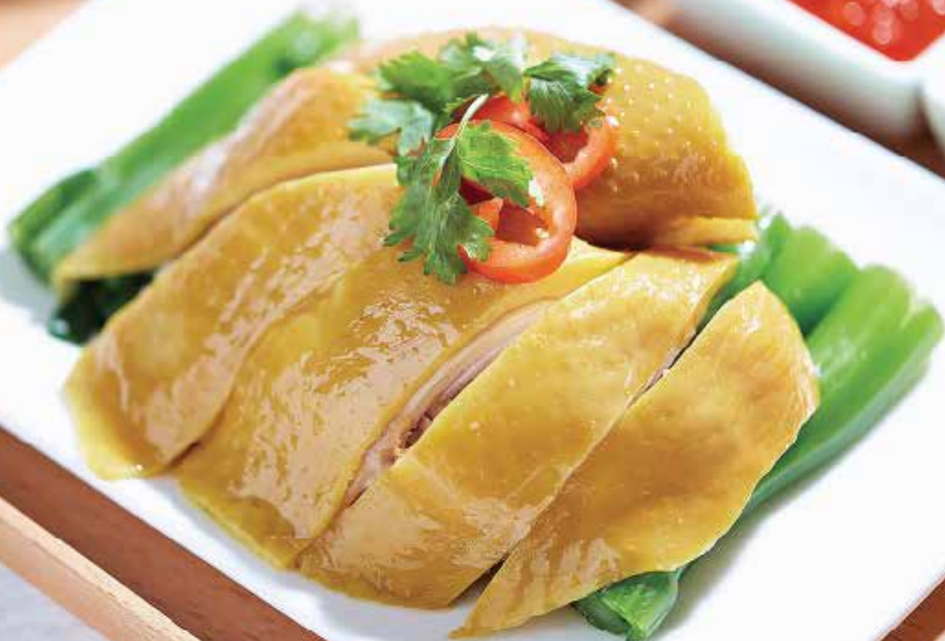
無骨海南雞飯 Hainanese Chicken Rice